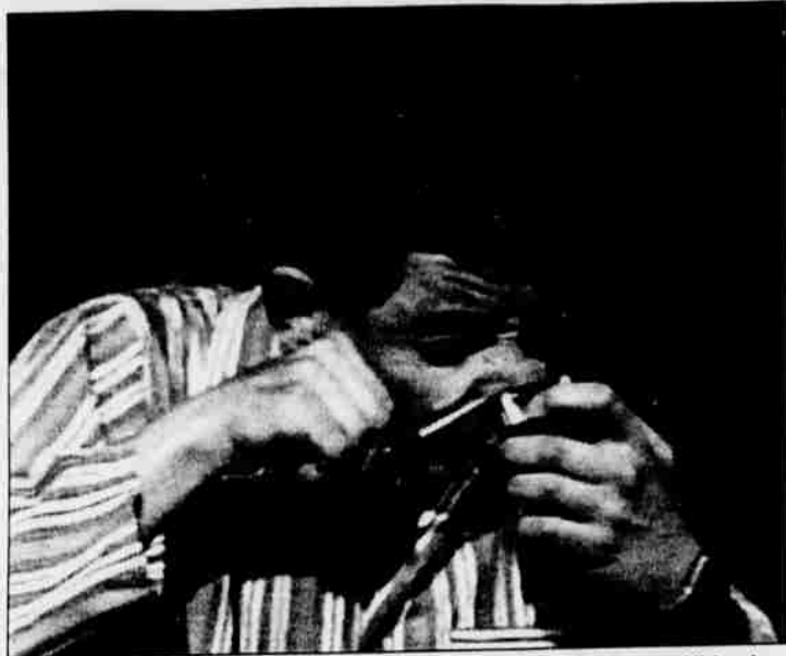
Mr. Bean (Rowan Atkinson) uses tweezers to pry an electric razor off his nose in "The Best Bits of Mr. Bean," which is currently available on video.

These videos of Mr. Bean have been sprouting up left and right. The latest is The Best Bits of Mr. Bean . Just as there are extremes between scorching hot and freezing cold, or butt-ugly and unbelievably gorgeous, Mr. Bean has its moments of hilariously comedic scenes intertwined with predictable corny spectacles.