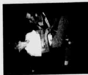
Above: Two audience members engaged in a passionate dip while swing dancing.