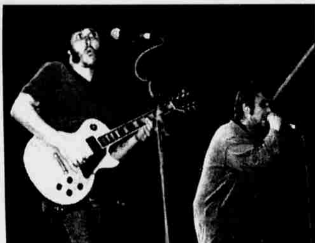
Below: Los Fabulosos Cadillac captivated the audience with their exotic vocals and jamming guitars.