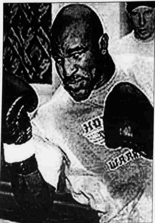
"The Real Deal" Holyfield works out in preparation for Saturday night's main event versus Michael Moorer

But this time around, the tide will change as Holyfield will do to Moorer like did to Mike Tyson. By landing his powerful jab, Holyfield will keep Moorer away from his body and be less vul-