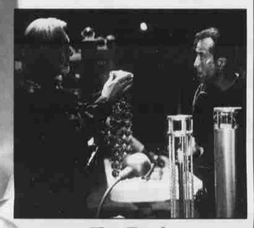
The Rock Hollywood Pictur

VERYBODY'S SO ANGRY THESE days. People are casting spells, getting revenge, stalking celebrities and stripping for a lousy buck. What's wrong with kids today? Where did we go wrong? Can't we all just get along? You know... smile on your brother? Try to love one another right now?