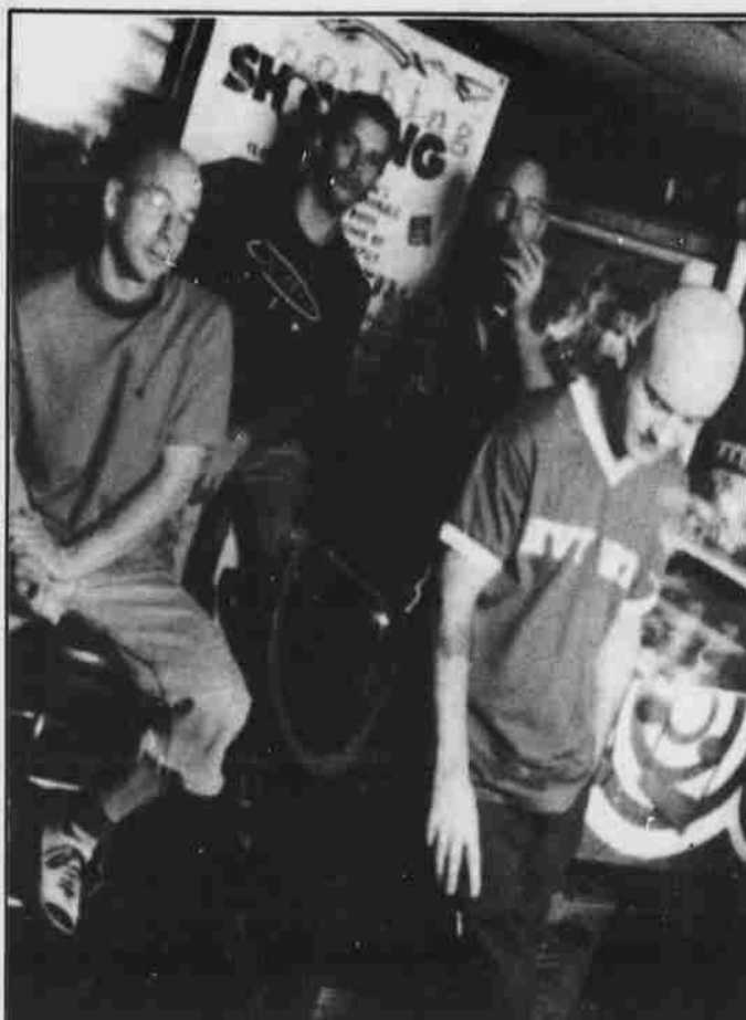
Miraingna, another soundtrack-famous group, releases album.

Overall, a full flavored concoction that chills like a Corona with a lime.