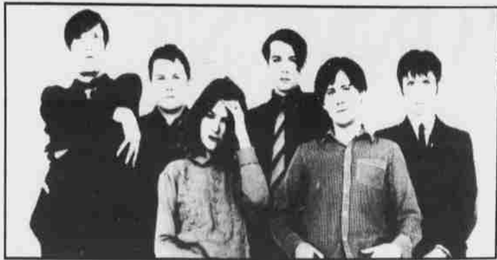
Pulp is just one of the English bands lighting up the scene