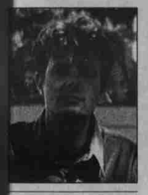
BY GLENN MCDONALD

ILLUSTRATION BY BRIGG BLOOMQUIST, U. OF KANSAS