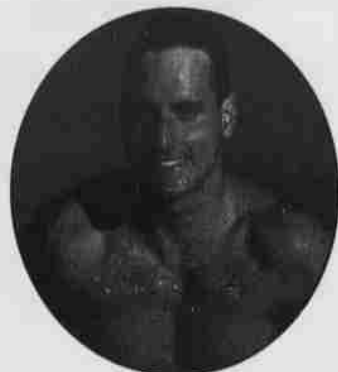
All this and brains, too, but can he cook? Page 12