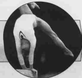
We bend over back- wards for you. Page 16