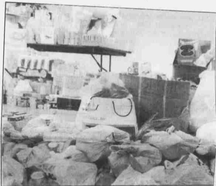
Students collected one ton of food for "Aid for AIDS of Nevada."