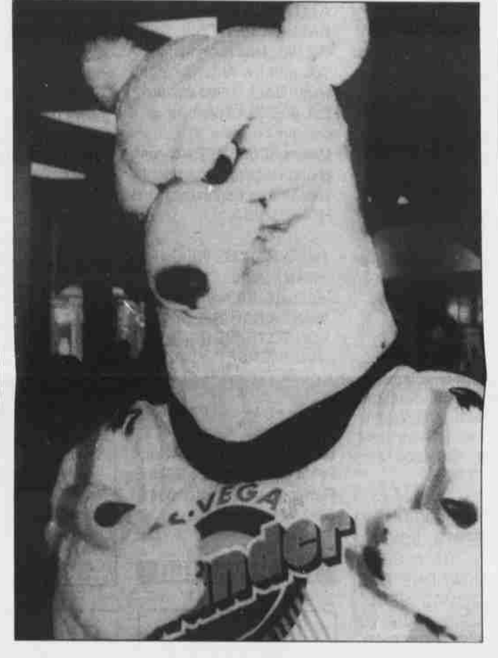
Boom Boom invites UNLV students to come out to the Las Vegas Thunder's home opener tommorrow night at 7 p.m. at the Thomas & Mack. Tickets are on sale today for $3.

UPS • FedEx • MAIL DROP 4440 South Maryland Parkway • (702) 735-4402 Shipping, Packaging • 6 month minimum rental