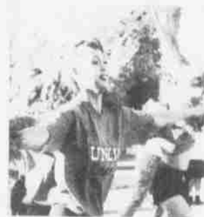
A look at today's Rebel cheerleaders and dance team.

Please see "More than a pretty face" in Features, page 7