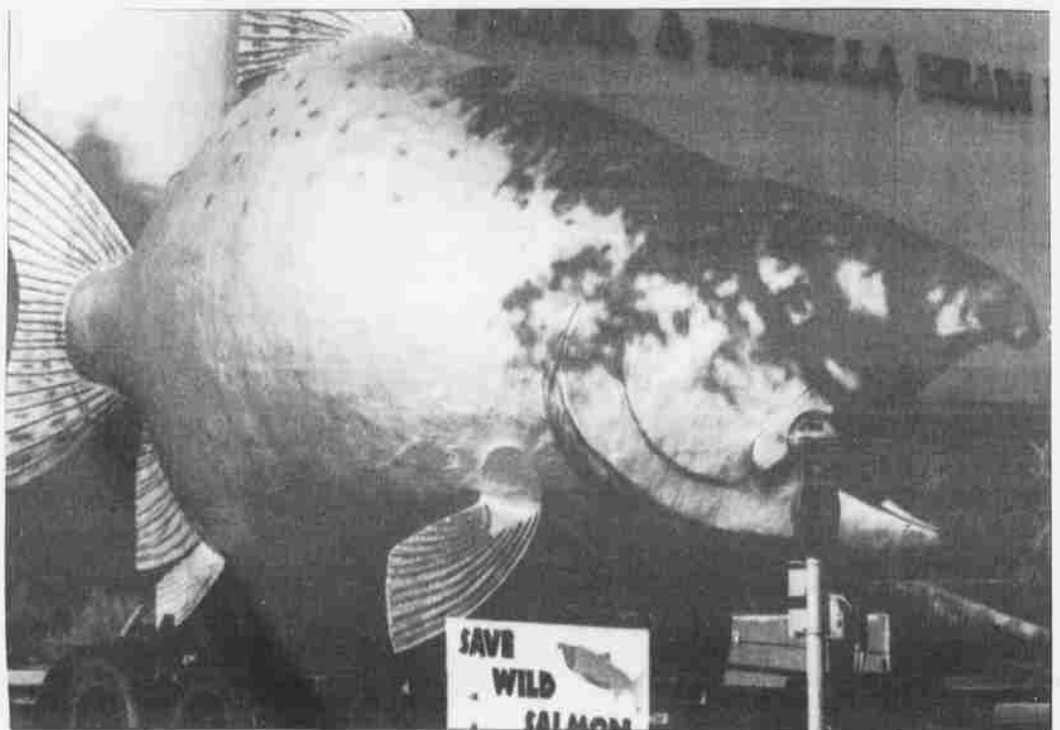
The Northwest Eco System Alliance brought Fin, a 25-foot, 1300-pound salmon fiberglass model, to UNLV Tuesday to inform students of endangered species.