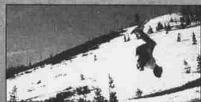
Cord Tramell, Oregon State U. "Suicide!" Pulling back flips off the 1/4 pipe at Hoodoo — on "Big Foot" skis.