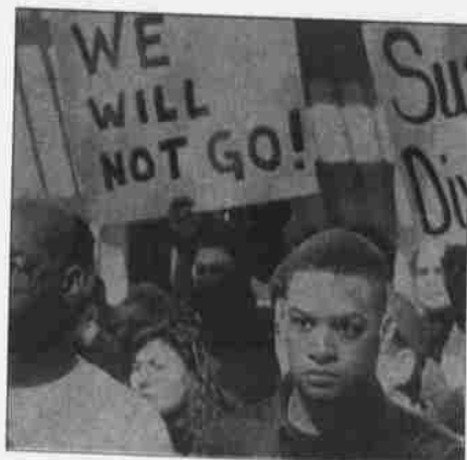
Affirmative action faces the fight of its life.