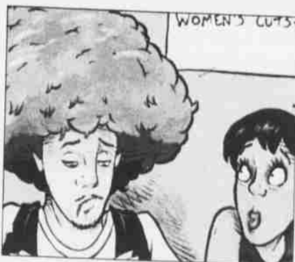
The hair up there.