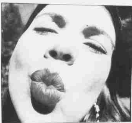
Mother puckers kiss and tell.