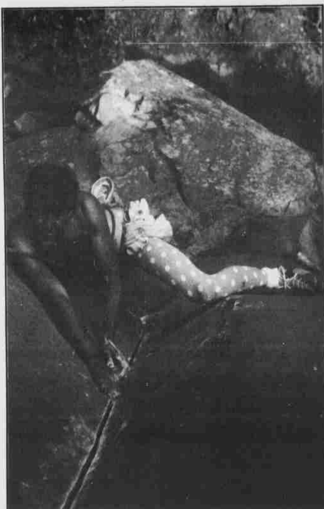
Rocks and Ropes is holding a climbing competition from 12 p.m. to 4 p.m. at their grand opening April 29. Entry is $12 the day of the competition to win great prizes. Grand Opening festivities also include open climbing from 4 p.m. to 10 p.m., free lessons, and free equipment rentals.