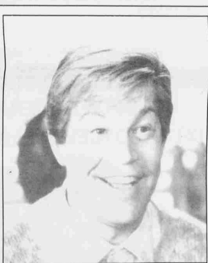
Why? Why do they still make stupid movies from bad "Saturday Night Live" skits? Because Lorne Michaels is way out of control. Stuart 'Straight to Video' comes out this week.

Try "http://www.ifi.uio.no/~terjesa/front242/main.html" and this will take you to a homepage (Front 242 is my favorite band). Here, you can find lyrics, album reviews, and interviews by using the cursor keys. Sites can be found on the various news-