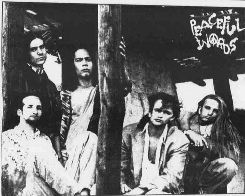
Earth Day is once again upon us. This Friday from 11 a.m. to 2 p.m. Earth Day will be celebrated in the Alumni Amphitheatre. Local band Peaceful Words will be playing in the afternoon. Come out and celebrate Earth Day with your fellow students.

One positive aspect of the play is that it probably left many members of the audience questioning the practices of their local Century 21 representatives.