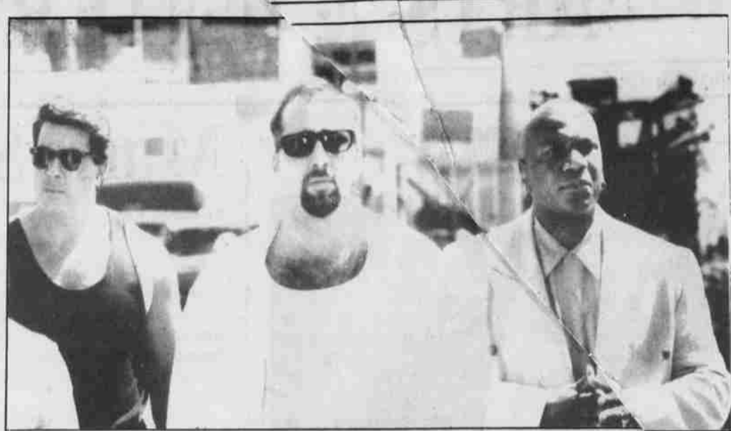
That's right, Ving James of Pulp Fiction co-stars with Nicolas Cage in Kiss of Death .