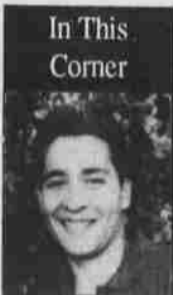
In This Corner

Just sitting around the office, peeling from the sunburn suffered down at that madness called Spring Break '95 at Lake Havasu. Yet again, it's notes d a y herein T h e C o r n e r.