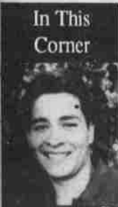
In This Corner