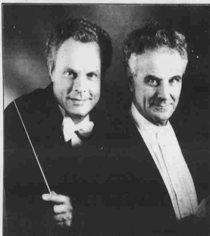
The BBC Philharmonic Orchestra, on its first U.S. tour, will perform under the direction of conductors Sir Peter Maxwell Davies (r) and Yan Pascal Tortelier at 8 p.m., March 23 in Artemus W. Ham Hall.