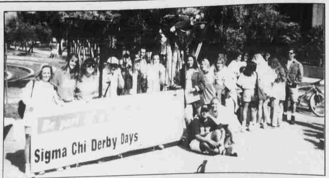
Sigma Chi's Jail-A-Thon held last week in the Alumni Amphitheatre raised over $800.

The UCCSN Board of Regents approved a change in the tuition and fees policy for non-resident, part-time students taking six or less credits per semester. This policy change was necessary to achieve parity in per credit hour charges with the recently revised "Good Neighbor" policy. Beginning in FY 1995-96, all non-resident students shall pay a tuition charge in addition to the per-credit consolidated registration fee applicable to all students. Non-resident students who are not covered by the "Good Neighbor" policy and who register for up to six credit hours in a semester shall pay the following tuition per credit hour: undergraduates will pay $52 and graduates at the universities will pay $42, while community college students will pay $15.50. This policy change will result in non-resident Good Neighbor students and non-resident part-time students paying the same per credit costs of: $46 for the community colleges, $110 for undergraduates at the universities and $124 for graduates at the universities.