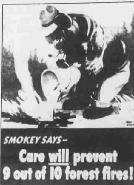
In a forest, kindle your spirit. Nothing more.

Thanks to Smokey, accidental wildfires caused by human have