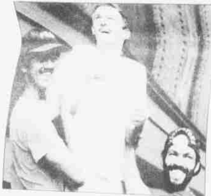
Spike Jonze, the man who would be king.