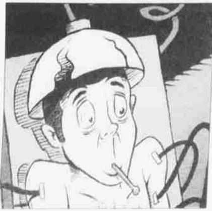
Your pain could be worth $$$$!