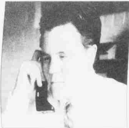
Entering the 9-to-5 world, in all its constipated glory.