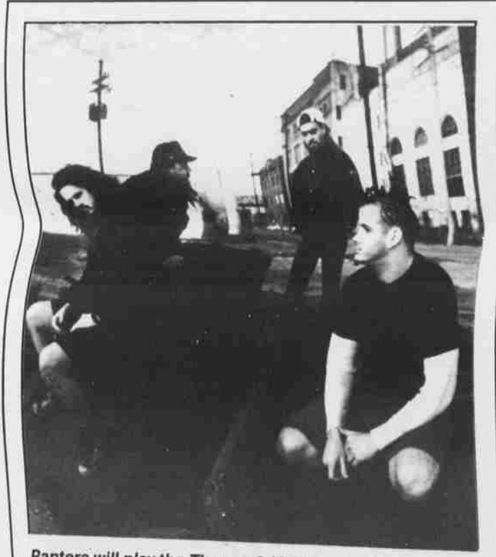
Pantera will play the Thomas & Mack on April 2. Tickets are expected to sellout, so get yours now.

Sleeping Beauty Act III (Dance)-Judy Bayley Theatre (UNLV), 2 & 7 p.m., $16 to $35