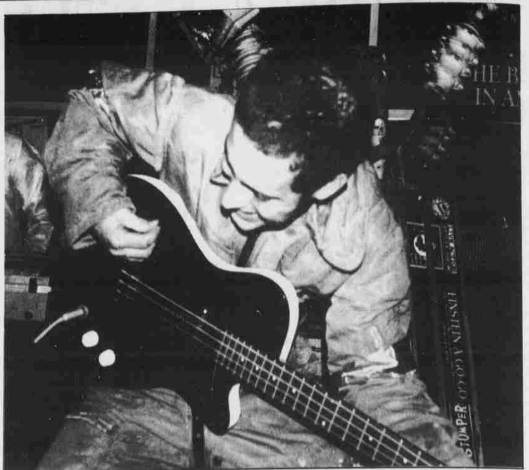
The rhythmic surf guitar sounds of Astro Man recently reverberated through Las Vegas.