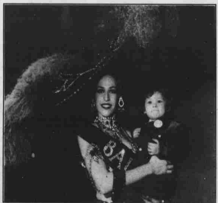
The Showgirl display is currently at the Marjorie Barrick Museum.

dent of Las Vegas, originally from Northern California, brings to the university an exhibition titled "Showgirl."