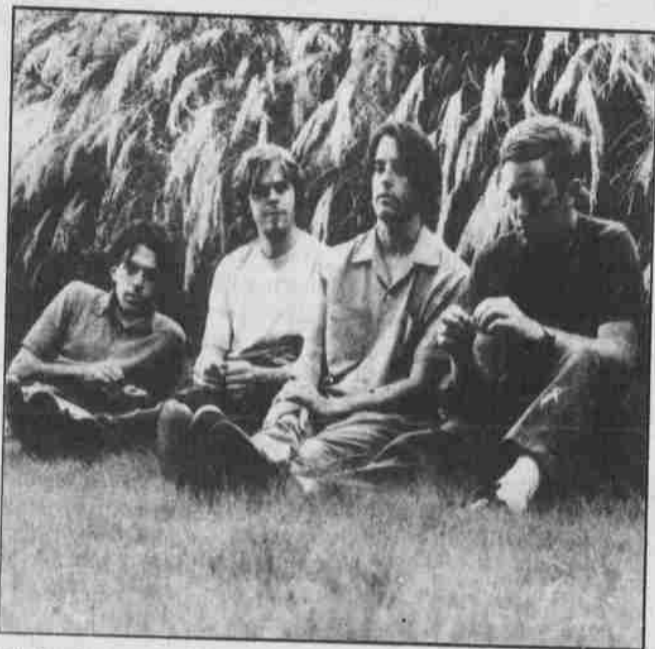
Idaho is coming to UNLV and guaranteed to sell more tickets than Adam Sandler (but that isn't too hard).