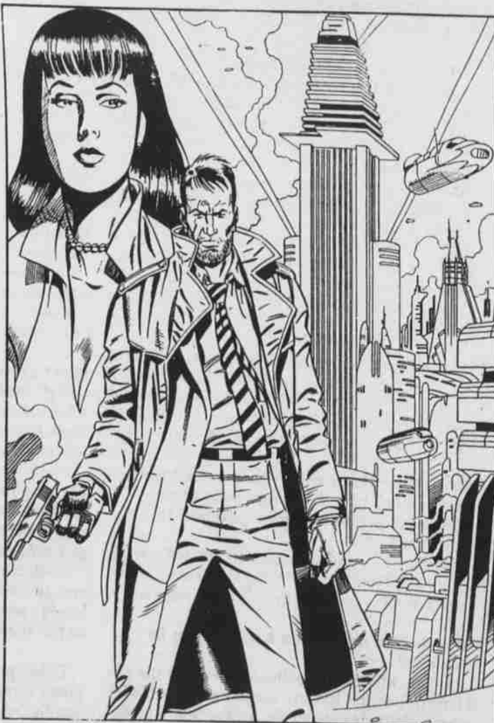
Tekno-Comix will be premiering the comic book Mickey Spillan's Mike Danger in May. Out now in Leonard Nimoy's Primortals.