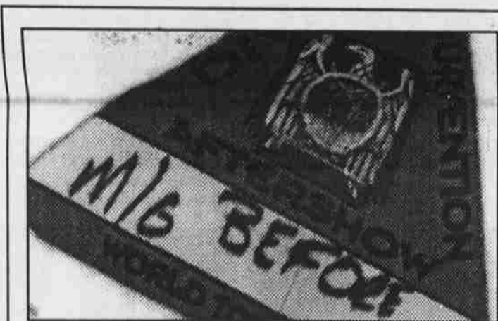
Slayer gave us passes but once again the T&M wouldn't let us bring in our cameras. It's their fault there are no photos of the violent crowd last Saturday.

Yo man! Sir Mix A Lot will star on "The Watcher" which is filmed in Vegas. In fact rumour has it that many UNLV film students have been abused as pro-