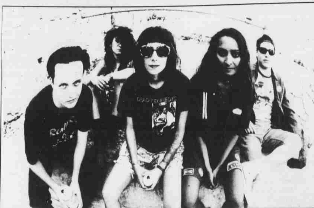
butt trumpet along with Schleprock will cause panic and dismay at the Huntridge this Friday. And the tickets are less than the Adam Sandler show.

The Rocky Horror Picture Show —Torrey Pines Theatre, Midnight Movie, $5