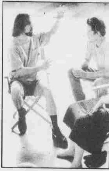
Richard Linklater, famed director of Slacker , has his new film Before Sunrise premiering this Friday at Sundance.

Legends of the Fall A Darkhorse In the Pack Reading the remarks from critics directed towards the recently released Legends of the Fall , I was inclined not to watch it. Gene Siskel is one of few critics who gave this film an 'A' rating, with Roger Ebert giving it a 'B'. However, it seems as though Peter Travers of the Rolling Stone and the rest of the critical mass has opted to denounce Legends of the Fall . The actual film, in my mind, proved to me one thing. Even if everyone in the entire world pans a film, still watch it if you want to. Legends of the Fall is one of the best movies I've seen in 1994-95. The cinematography was spectacular; absolutely fantastic. Cin-