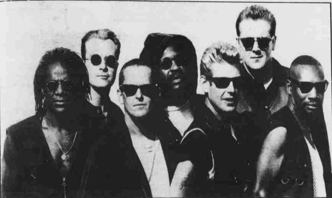
The Specials dazzled a large crowd at the Huntridge last week with their blend of original ska.

The Specials and Lets Go Bowling played the Huntridge Oct. 26.