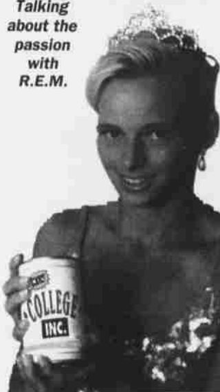
Welcome to MegaCola U. Thirsty?