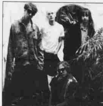
Talking about the passion with R.E.M.