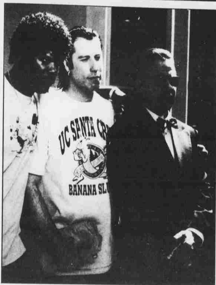
Samuel L. Jackson (l. to r.), John Travolta and Harvey Keitel getting ready for another day on the beaches of Los Angeles in Quentin Tarantino's Pulp Fiction opening Friday.