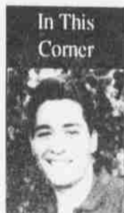
In This Corner

His offense at up-state Nevada led the nation in total offense in 1993. And when he promised to fill the air above Sam Boyd Stadium with footballs, you know that returning Rebel receivers were anxious.