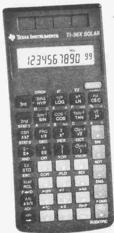
The TI-36X SOLAR, a general purpose workhorse, is powered by ANYLITE™ solar cells so you never need batteries.

No matter which classes you're taking, TI Scientific and Business Calculators are what you need to succeed. Try one at your local TI retailer today, or for more information, call 1-800-TI-CARES.