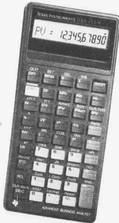
The BA II PLUS™ has unique display prompts that guide you through problems. It offers basic business functions like time-value-of-money, plus cash flow analysis for internal rate of return (IRR) and net present value (NPV).