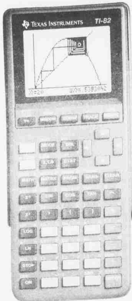
The TI-82 Graphing Calculator has comprehensive, easy-to-use graphing features and a unit-to-unit link for storing data and programs.

The little dance floor at the pub was jampacked and slippery with the sweat of all those dancing bodies groovin' and movin' to the funk, blues rhythms pulsating from the stage as The Carvin Jones Band played on through the night.