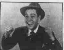
Subject after receiving Citibank Classic Visa Photocard.

first credit card with your photo on it. A voice inside says, "This is me, really me." (As opposed to, "Who the heck is that?"—a common response to the photo on one's Student ID.) It's an immediate form of ID, a boost to your self-image. ¶ Of course if your card is ever lost or stolen and a stranger is prevented from using it, you'll feel exceptionally good (showing no signs of Credit Card Theft Nervosa). ¶ Other experts point to other services, such as The Lost Wallet™ Service that can replace your card usually within 24 hours. Or the 24-Hour Customer Service line, your