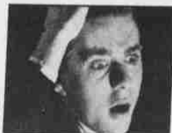
Subject suffering from Credit Card Theft Nervosa.

The Citibank Classic Visa instills in students feelings of safety, security, and general wellness not unlike those experienced in the womb. Therefore, it is the mother of all credit cards. ¶ Some experts attribute these feelings to the Citibank Photocard, the