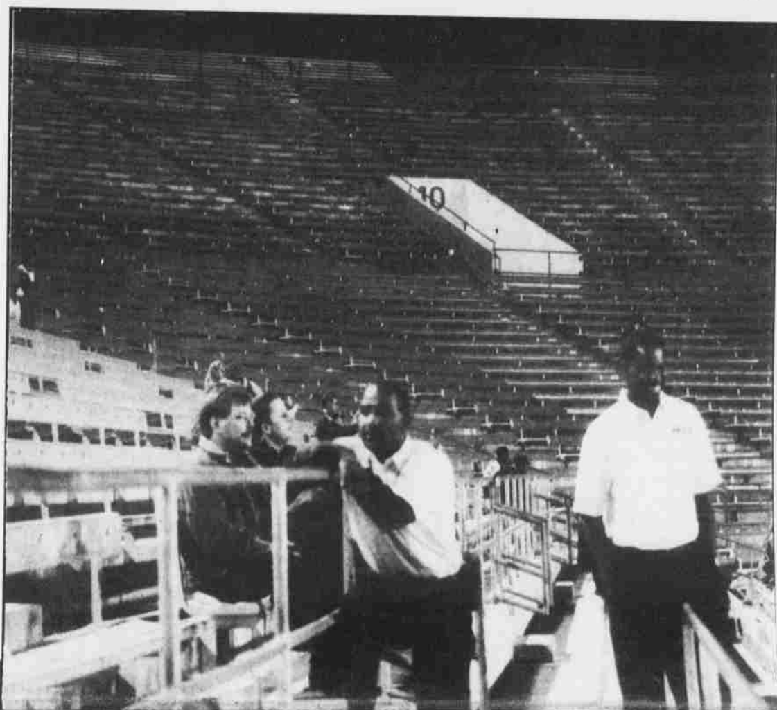
In the wake of a beer ban, student attendance declined sharply at Saturday's football game.

"I think we need to set an example with the people who caused the problem," she said. "But you don't take (privileges) away from everybody on campus. If I were an average student on this campus, I would be very angry because a few individuals took away my privileges."