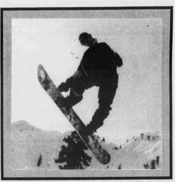
The back country of Utah is just a short six and a half hours away J. Quinlen.Brighton. by car from UNLV.

Tickets for the Sunday performance are available at the Performing Arts Center Box Office