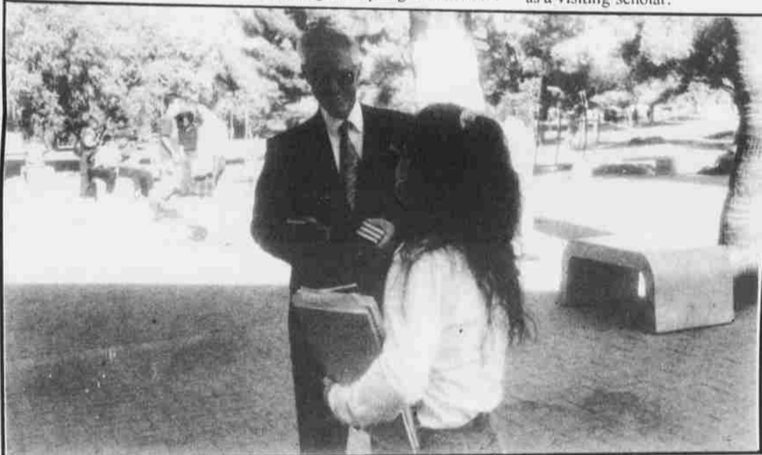
Separation of church and state. Gideons handed out bibles at UNLV on Wednesday.