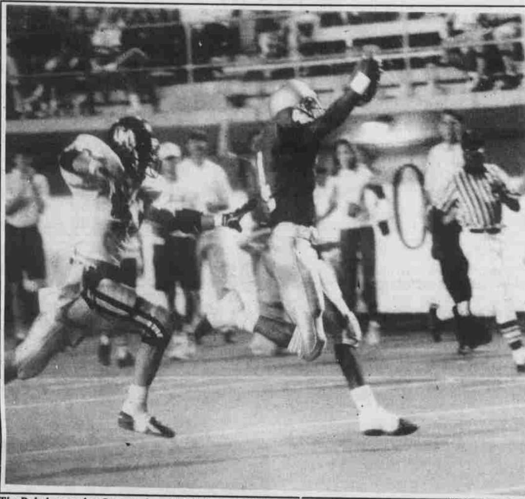
The Rebels travel to Reno to face the Wolf Pack this Saturday for the Fremont Cannon.