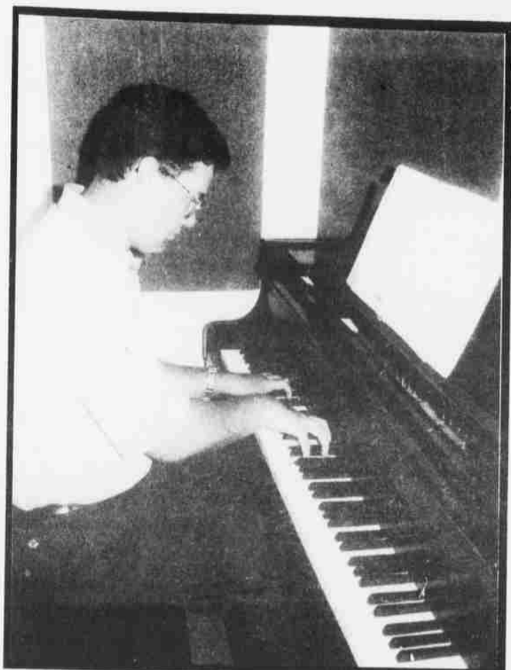
Liberace is missed by the UNLV students but his entertainment profits help to buy new pianos.

"I think this is either the first or second year we've dropped from $10,000 to $7,500," he said. "My understanding is that in recent years the amount of income that they're getting, as is the case with almost all foundations, has dropped, and with that so The Liberace Foundation is a non-profit organization created by the late entertainer in 1976 to provide scholarships for the arts.