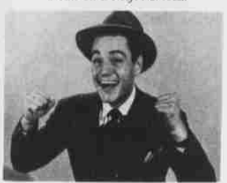
Subject after receiving Citibank Classic Visa Photocard.

on one's driver's license.) It's an immediate form of ID, a boost to your self-image. ¶ Of course if your card is ever lost or stolen and a stranger is prevented from using it, you'll feel exceptionally good (showing no signs of Credit Card Theft Nervosa). ¶ Other experts point to specific services, such as The Lost Wallet Service that can replace your card usually within 24 hours. Or the 24-Hour Customer Service line, your hotline, if you will, for any cardrelated anxiety whatsoever. ¶ Further analysis reveals three services that protect the purchases you make on the Citibank