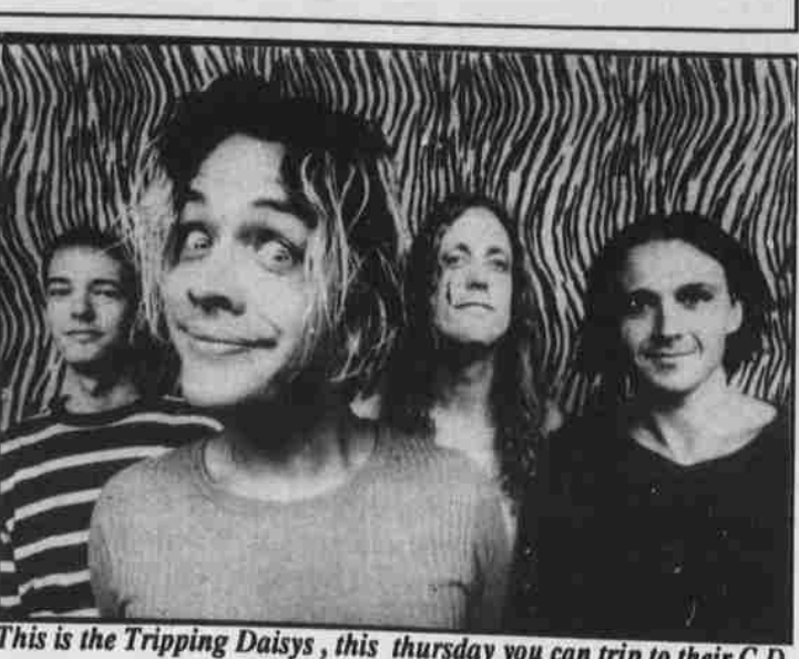
This is the Tripping Daisys, this thursday you can trip to their C.D. rewiew only in Variety, your student entertainment section!