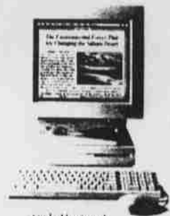
Apple Macintosh LC III 480, Apple Basic Color Monitor & Apple Keyboard II $1322.50