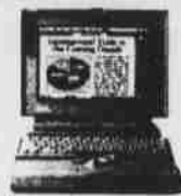
Apple PowerBook™ 145B 480, Built in Keyboard & 10" Backlit Super Twist Monochrome Display $1352.50