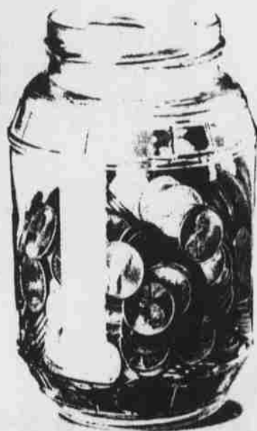
That penny jar on your dresser