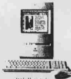
Apple Macintosh LC 480 Class 480, Built in 10" Color Monitor and Apple Keyboard II $999