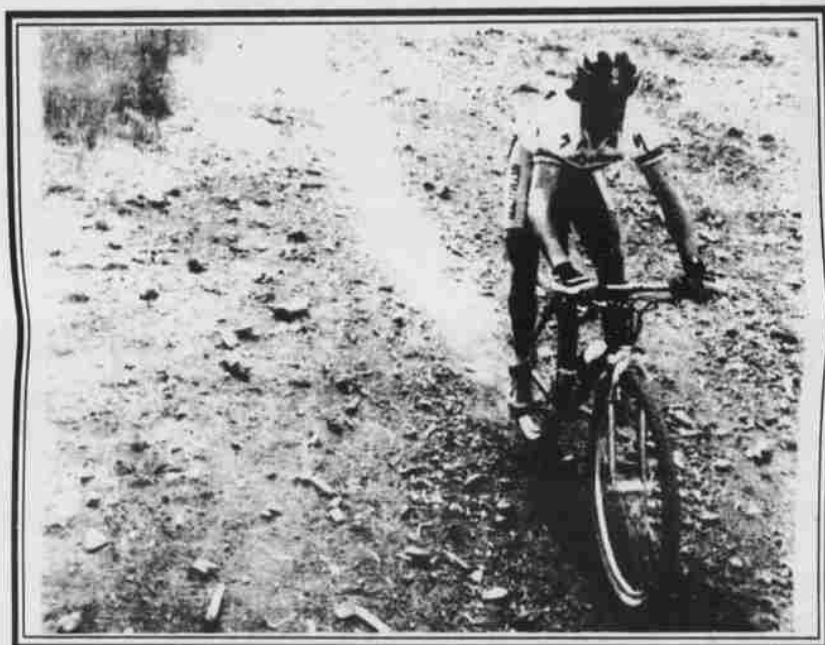
Last weekend Brianhead hosted a downhill mountainbike race, mountain biking is at an all time high of popularity with UNLV students.