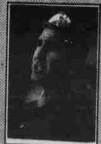
Strong Opener at Clemson