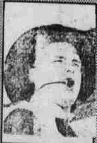
All About Garth