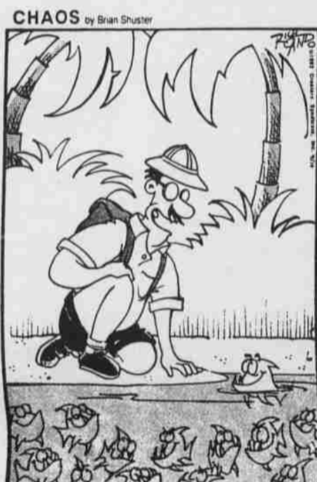
"A secret? Wait, I can't hear you, let me get closer."