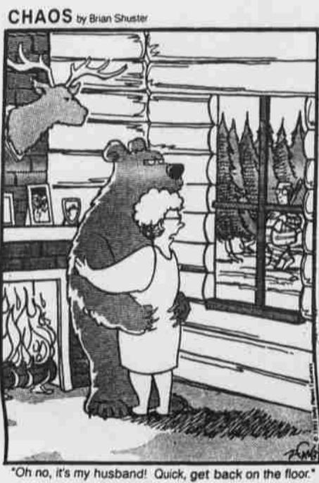
"Oh no, it's my husband! Quick, get back on the floor."