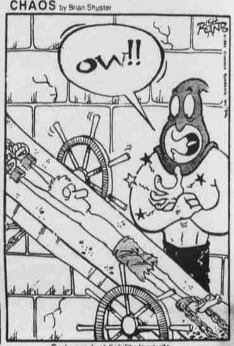
Early product liability lawsuits.