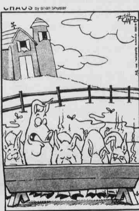
"Hey, Ralph, would you pass the salt?"