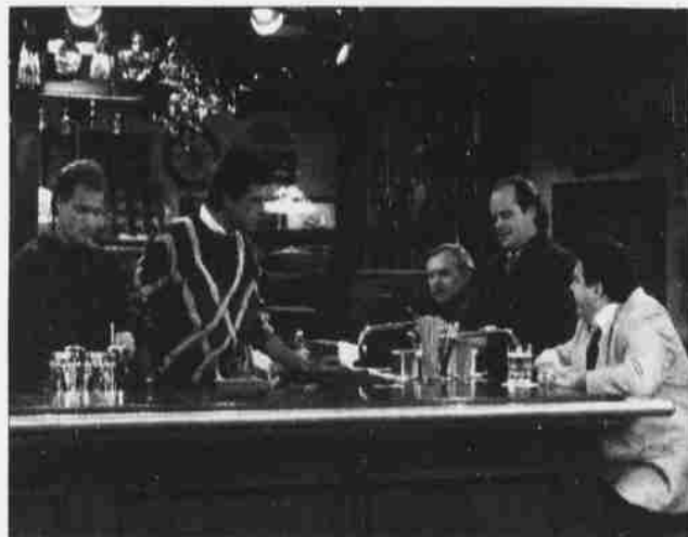
Here's one word for all you mourning Cheers fans — reruns.

His comic tone transforms to a quiet, sincere response: "I'm happy now. I'm very happy. But it has taken a long time for me to come to that." U