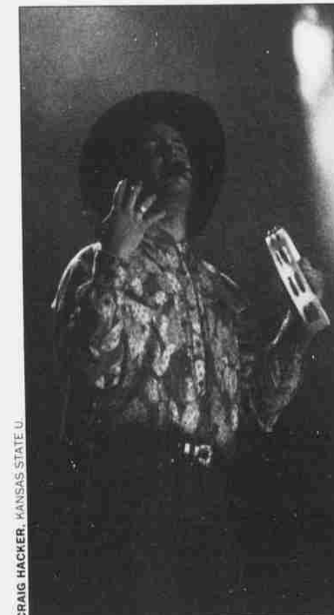
Garth Brooks pours his hat and soul into a show at Kansas State U.