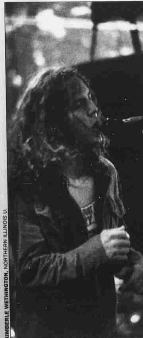
KIMBERLE WETHINGTON, NORTHERN ILLINOIS U. Eddie Vedder of Pearl Jam at Lollapalooza '92 at Alpine Valley, Wisc.: Lots o' hair, lots o' flannel, lots o' guitar.