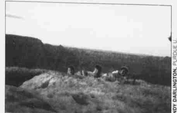
ANDY DARLINGTON, PURDUE U. Purdue U. students hang out in the Grand Canyon.