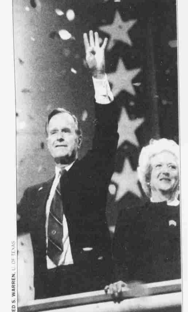
Above: George and Barbara Bush at the Republican National Convention.

With the click of a shutter, student photographers from across the country captured some of the most memorable moments of the year. These are the best of the best of the more than 3,000 photo entries. The Grand Prize winner from each of four categories wins $1,000, with each runner-up receiving $50.