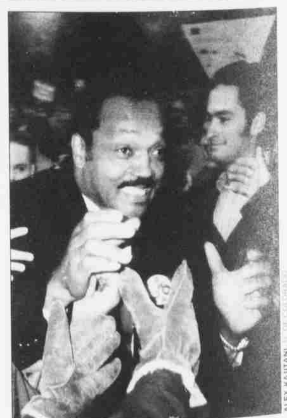
A "Get Out and Vote" rally with Jesse Jackson in October 1992.