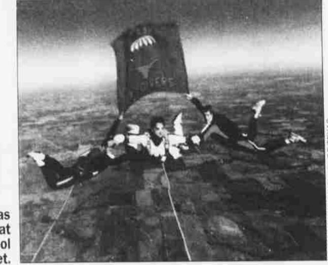
Right: Members of The Texas Skydivers, the skydiving team at the U. of Texas, sport their school spirit at 5,000 feet.