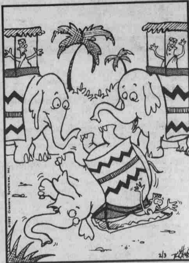
"Hey, look what Roland's doing!"